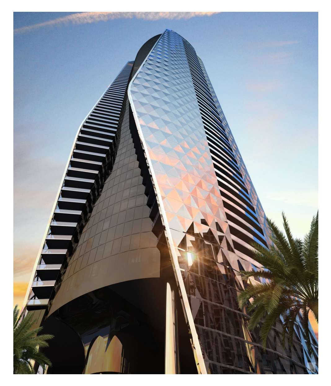
\label{lem:bentley} \textbf{Bentley Residences boasts a dramatic architectural profile}.